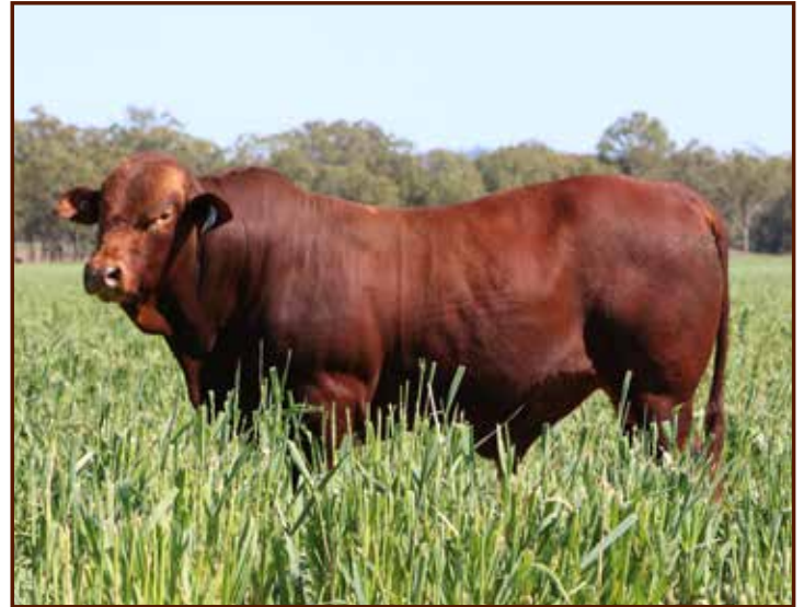
SANTA GERTRUDIS BREEDPLAN EBVS

Eidsvold Stn Emily E865 had nine calves in nine years. One son, J158 sold to Hayes Grazing and another, M356 to Australian Green Properties. ICP: 368