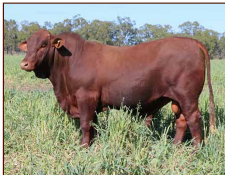
SANTA GERTRUDIS BREEDPLAN EBVS