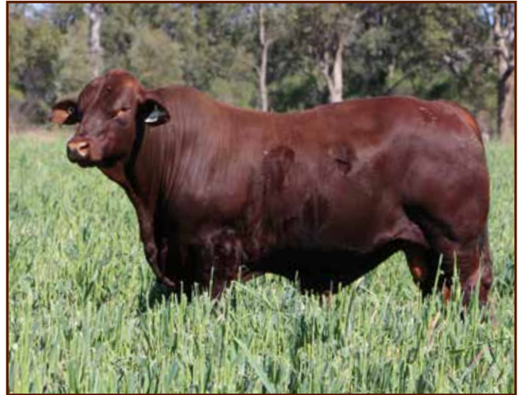
SANTA GERTRUDIS BREEDPLAN EBVS

Eidsvold Stn G537 was in the Island Scrub multiple herd and Lily was the only calf to be mothered up.