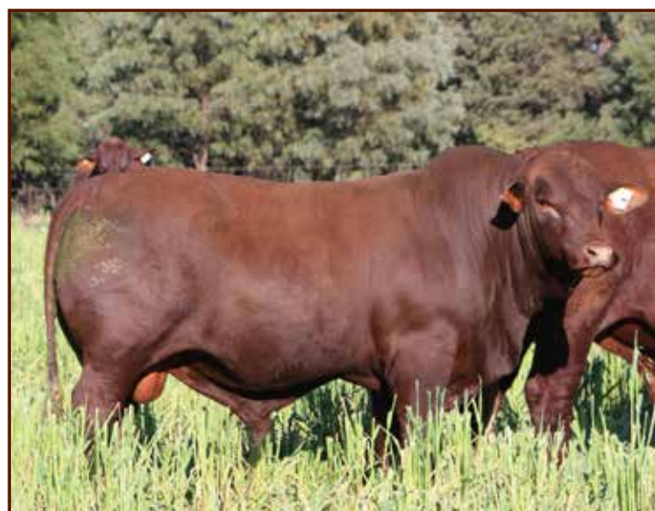
SANTA GERTRUDIS BREEDPLAN EBVS