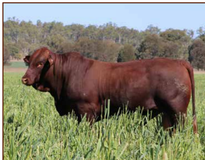
SANTA GERTRUDIS BREEDPLAN EBVS

Eidsvold Stn Kerry K555 had three calves in three years. Q618 is her first bull. ICP: 367