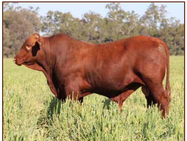
SANTA GERTRUDIS BREEDPLAN EBVS