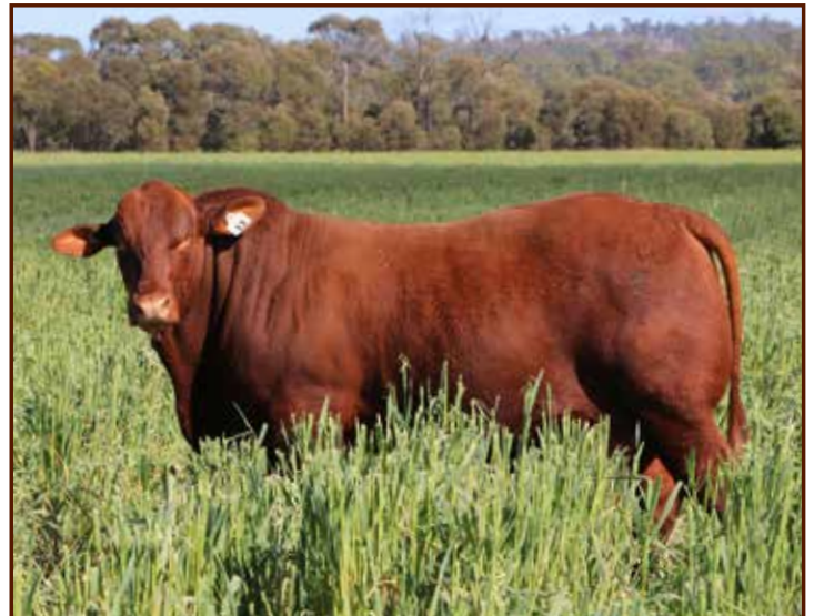
SANTA GERTRUDIS BREEDPLAN EBVS

Greenup Zeva K93 (P) calved as a two year old. She was held over to get in sync with the cow herd. She has had two more calves in two years. Greenup Zeva Z63 (P) calved as a two year old. She was held over to get in sync with the cow herd and had ten calves in eleven years. ICP: 408