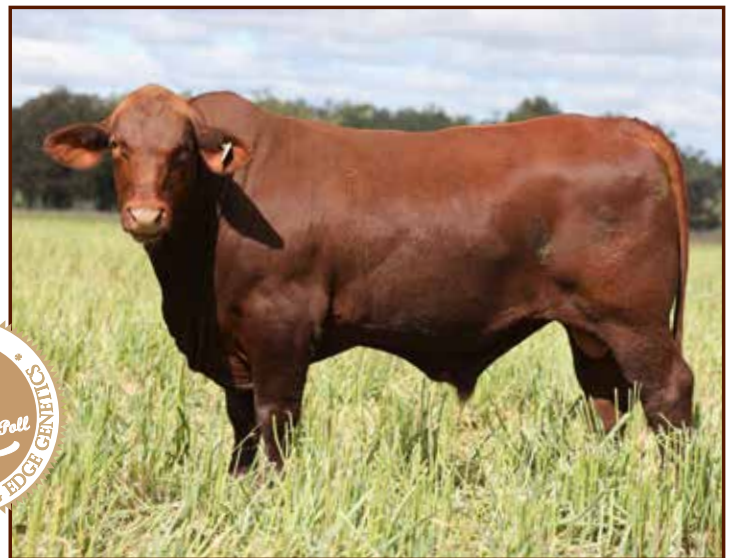
SANTA GERTRUDIS BREEDPLAN EBVS

Greenup Yankee W760 (P) Greenup Boutique B135 (P) Rosevale Galah W473