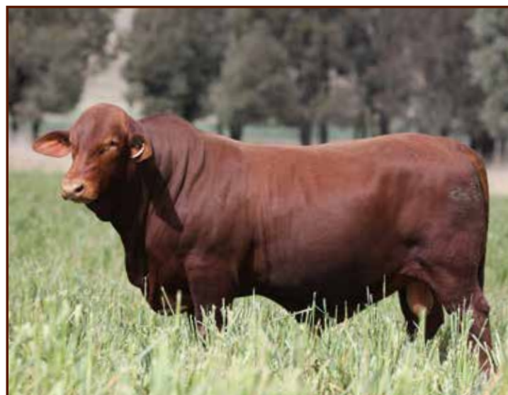
SANTA GERTRUDIS BREEDPLAN EBVS