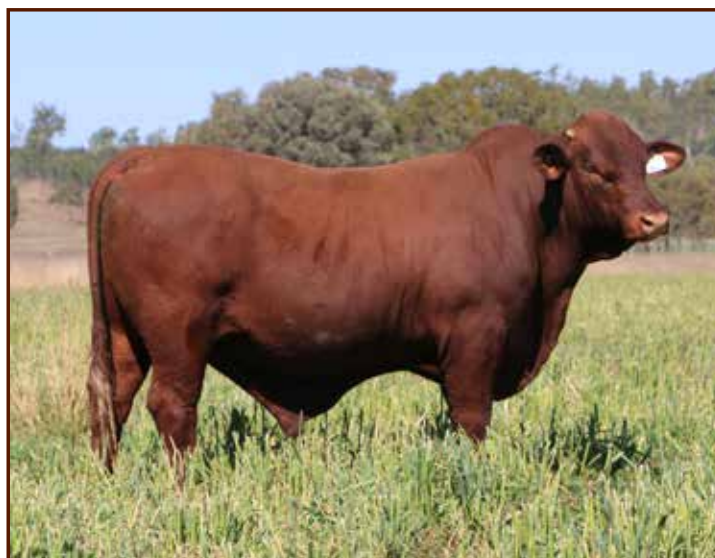
SANTA GERTRUDIS BREEDPLAN EBVS