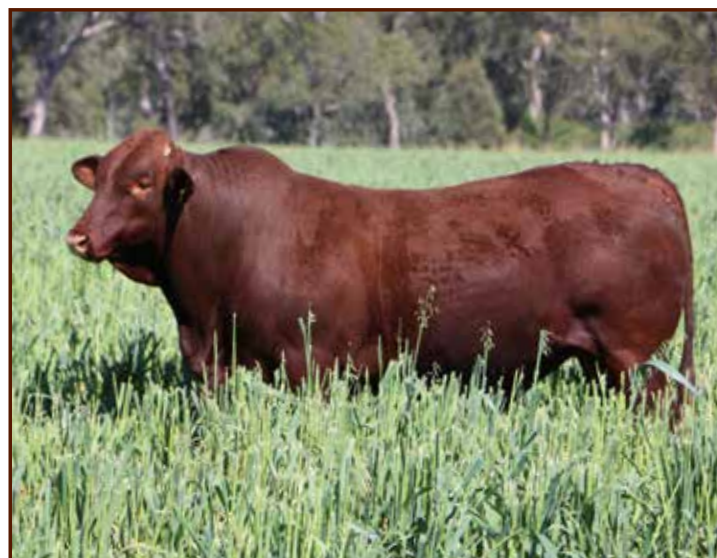
SANTA GERTRUDIS BREEDPLAN EBVS

Eidsvold Stn D529 (P) had five calves in six years.