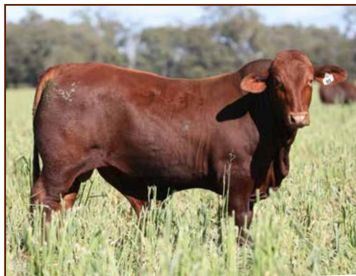
SANTA GERTRUDIS BREEDPLAN EBVS

Greenup Aurora A81 (P) had four calves and was culled PTE.