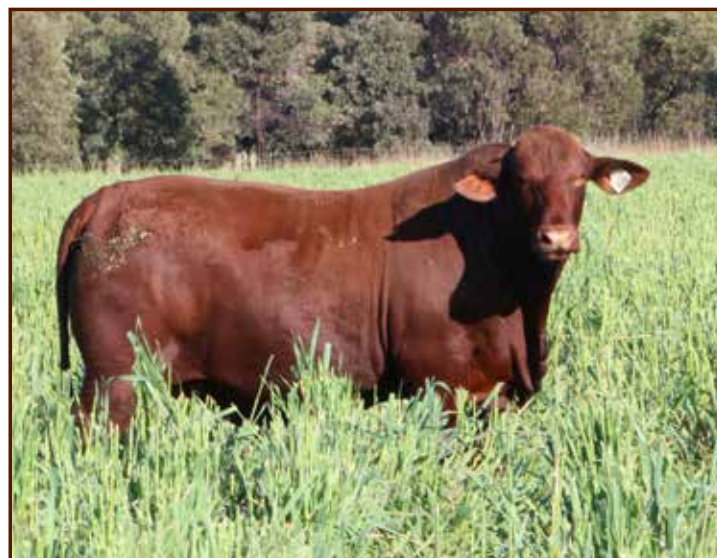
SANTA GERTRUDIS BREEDPLAN EBVS

Greenup Cinnamon C125 (P) calved a two year old and had eight calves in nine years. She is the granddam of Lots 12, 88, 101 & 108.