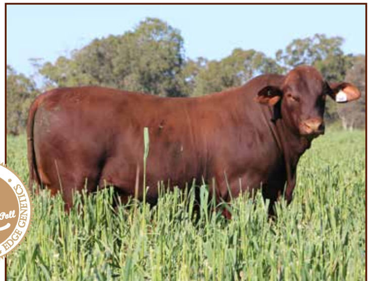
SANTA GERTRUDIS BREEDPLAN EBVS