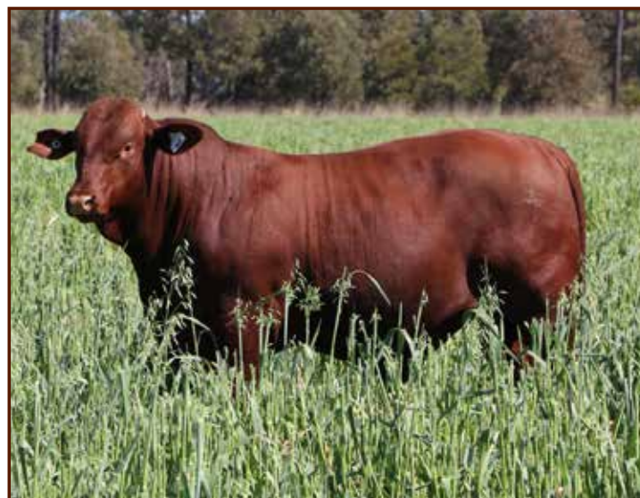
SANTA GERTRUDIS BREEDPLAN EBVS