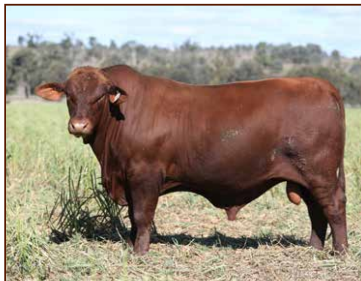
SANTA GERTRUDIS BREEDPLAN EBVS

Greenup Caddy C187 had seven calves in eight years.