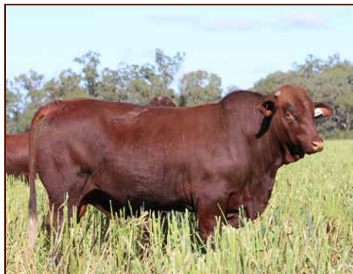
SANTA GERTRUDIS BREEDPLAN EBVS

Classified Santa Gertrudis Bull Classified Santa Gertrudis Cow Classified Santa Gertrudis Cow