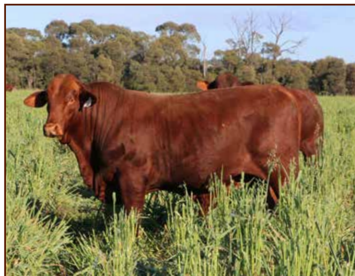
SANTA GERTRUDIS BREEDPLAN EBVS

Greenup Cinnamon L111 (P) calved as a two year old and was brought in sync with the cow herd. She has had another two calves in two years. Her first was a heifer by the neighbour's Charbray, Q310 is her second, her last is a heifer by Fitzy. Greenup Cinnamon C125 (P) calved as two year old and had eight calves in nine years. She is the granddam of Lots 12, 88, 101 & 108. ICP: 412