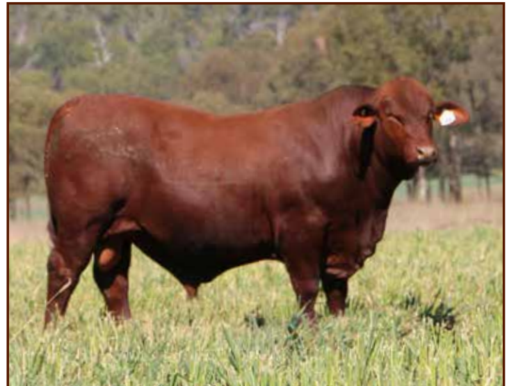
SANTA GERTRUDIS BREEDPLAN EBVS

Greenup Genie G79 (P) calved as a two year old and had three calves before going missing.