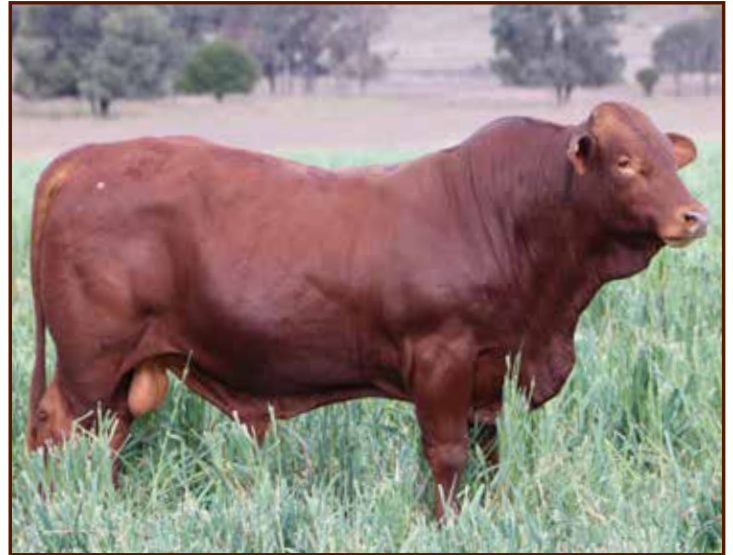
SANTA GERTRUDIS BREEDPLAN EBVS